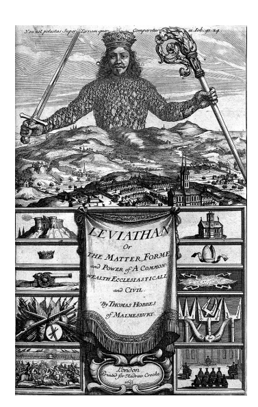
Fig. 2 The title page of Thomas Hobbes' 1651 Leviathan

The sovereign produces and guarantees the situation in its totality. He has the monopoly over this last decision. Therein resides the essence of the state's sovereignty, which must be juristically defined correctly, not as the monopoly to coerce or to rule, but as the monopoly to decide. The exception reveals most clearly the essence of the state's authority. The decision parts here from the legal norm, and (to formulate it paradoxically) authority proves that to produce law it need not be based on law.<sup>22</sup>