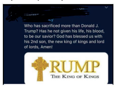
Screenshot of a public Facebook post from a Trump supporter on October 23, 2020.

For most of us, it was obvious what had occurred right before our very eyes. Specialists the world over watched the formation of a genuine cult of personality develop in real time. Of course, this Trumpcult would have